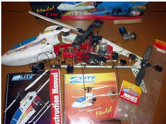
Here is the before shot