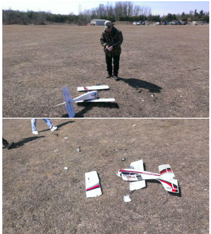
Oops, it fall down....see Pg 3 for the story

Ending Balance: $2594.66 Equipment Fund: $2990.91 Grand Total: $5585.57