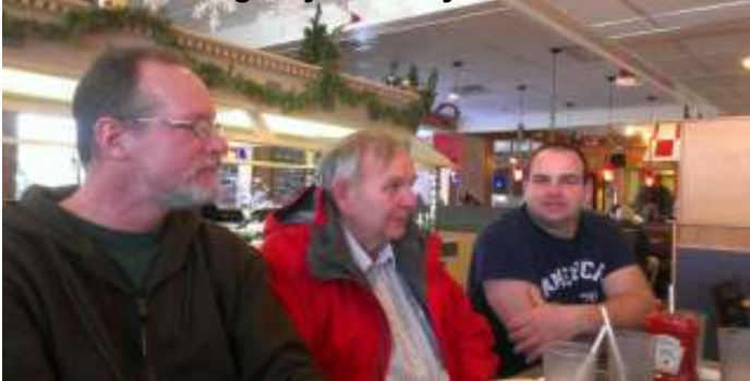
Breakfast at Big Boys in Marysville 01-01-2013