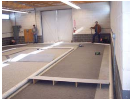
Spotters help keep the cars going.