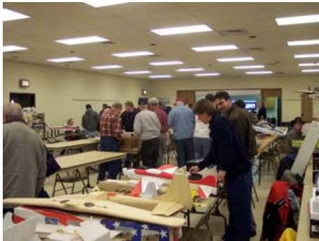
You could grab your food and watch some R/C crash videos.