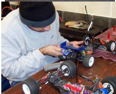
Engine temperatures after the race are checked. This one's 117 degrees. It's starting to cool off already.

You must be a ROAR (insurance) member to race, but anyone can come out and watch.