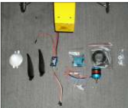
photo shows a folding prop that came with the Motor and BEC controller

From left to right these are the planes I got to 'Electrify'. A cute tiny plane with the name of Miss Bohemia that was flown ear-lier with a brushed gear motor and a seven pack of AA Ni Cads for power, a no name foam soaring machine that already has a brushless geared motor and BEC control-ler and the pretty Yellow and Blue fuselage you see is the Gentle Lady by Carl Gold-berg models.