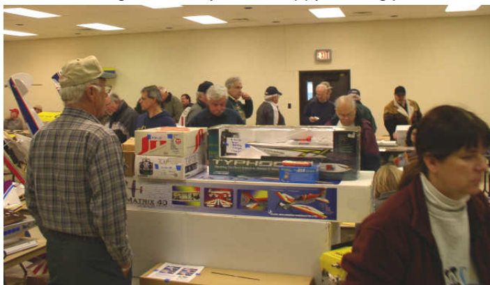
The Broken Prop