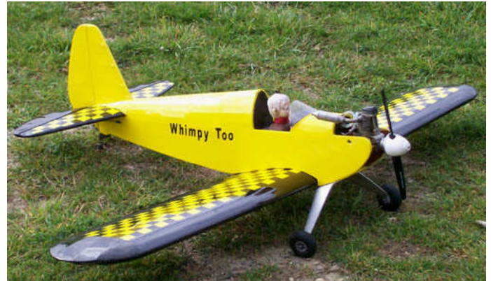
The Whimpy II lemon Ade

I had Black and Yellow covering in my stash. While I was getting out the covering I exposed some Black and Yellow checkerboard covering that had lain dormant for so many years I forgot I had it. And there was enough to do some trimming with it. I tested a piece to see if it would still iron on and it did so all I had to do was decide how to use it.