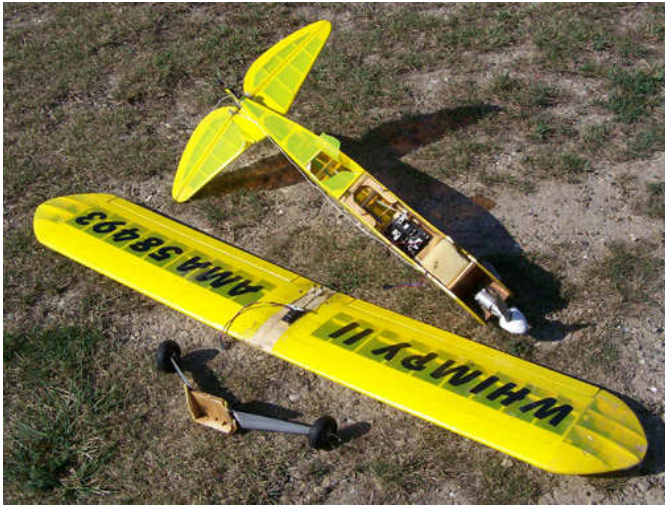
The Whimpy II Lemon